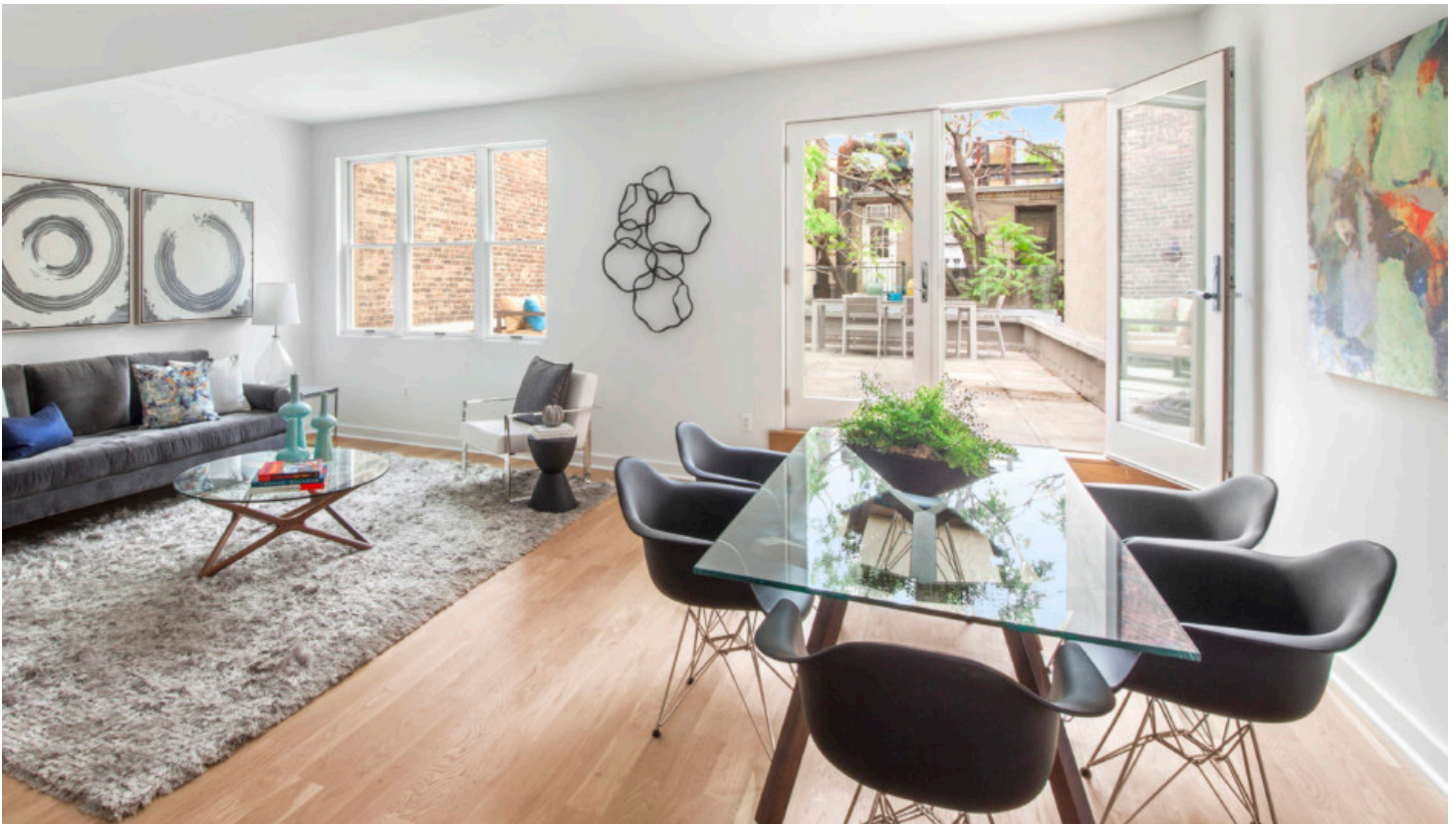
PENTHOUSE AT 415 EAST 6TH

It offers buyers two unique 1,900 s/f floor-thru residences and a duplex penthouse at over 2,500 s/f designed within a historic, 1910 neoclassical limestone façade that features ornate architectural details and original stained glass windows. Prices range from $2.95 million to $4.395 million.