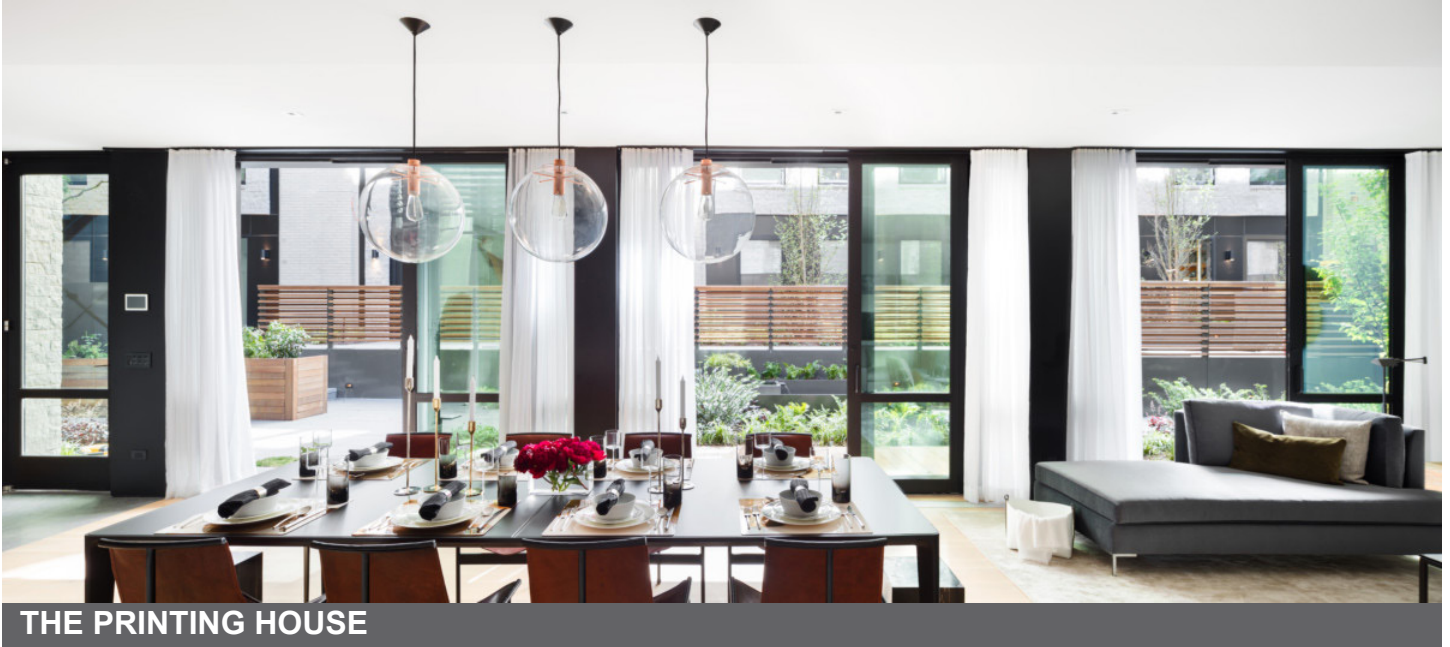
THE PRINTING HOUSE

All sales and marketing is being handled by The Corcoran Group.