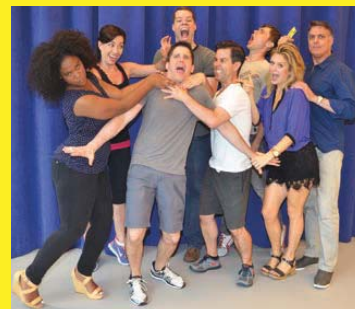
Rehearsal photo by Barry Gordin shot at the New 42nd Street Studios in NYC.